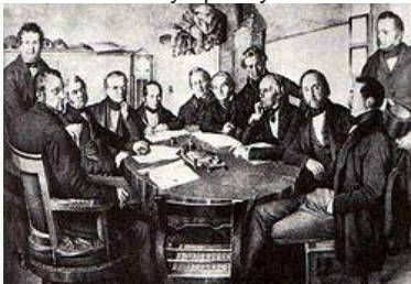
A meeting of a board of directors of the Leipzig–Dresden Railway Company in 1852

A board of directors is a group of people who jointly supervise the activities of an organization , which can be either a for-profit business, nonprofit organization , or a government agency . Such a board's powers, duties, and responsibilities are determined by government regulations (including the jurisdiction's corporations law ) and the organization's own constitution and bylaws . These authorities may specify the number of members of the board, how they are to be chosen, and how often they are to meet.