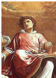
Saint Stephen , one of the first seven deacons in the Christian Church, holding a Gospel Book in a 1601 painting by Giacomo Cavedone .

It is generally assumed that the office of deacon originated in the selection of seven men by the apostles, among them Stephen , to assist with the charitable work of the early church as recorded in Acts 6 . [4][5]