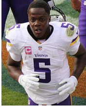
Bridgewater with the Vikings in 2015

"In order to have a testimony , you have to have a test. I come from amazing DNA; I watched my mom fight and win against breast cancer. We will, as a team, attack my rehab with the same vigor and energy. My faith is strong, my faith is unwavering, and my vision is clear. My purpose will not be denied."