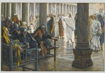
James Tissot, Woe unto You, Scribes and Pharisees , Brooklyn Museum

The Woes of the Pharisees is a list of criticisms by Jesus against scribes and Pharisees recorded in the Gospels of Luke 11:37–54 and Matthew 23:1–39 . [1] Mark 12:35–40 and Luke 20:45–47 also include warnings about scribes. Eight are listed in Matthew, and hence Matthew's version is known as the eight woes. These are found in Matthew 23 verses 13, 14, 15, 16, 23, 25, 27 and 29. Only six are given in Luke, whose version is thus known as the six woes. The woes mostly criticize the Pharisees for hypocrisy and perjury . They illustrate the differences between inner and outer moral states. [1]