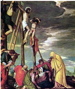
Kalvarienberg by Paolo Veronese.