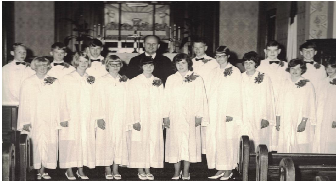
Confirmation 1967 at Immanuel Lutheran Church in Story City, Iowa. Author in back row, far left.