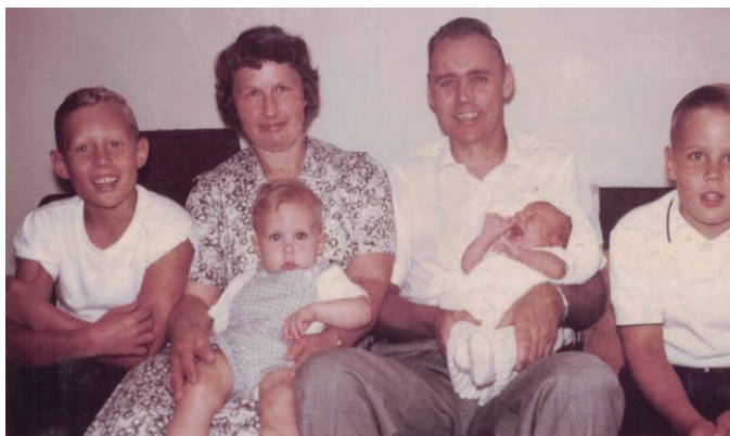
The author (far left) at home following the youngest brother's baptism.

My parents believed that the home is the primary training ground for passing on the faith. Our Daily Bread Promise Box filled with Bible verses was passed around among my parents and brothers at each meal before eating. Many of the pictures on the walls contained faith messages, and, of course, there were messages on the refrigerator. I was quizzed on my lesson before going to Catechism. Both parents taught Sunday School. The faith was both taught and caught. Their formation of faith made me who I am today.