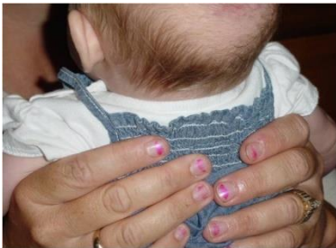
Caring for children

Images for Interim Pastor will: Provide pastoral care