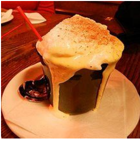
A Tom & Jerry cocktail

https://en.wikipedia.org/wiki/Tom_and_Jerry_(cocktail) Images for Tom and Jerry (cocktail)