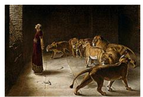
Briton Rivière (1890)