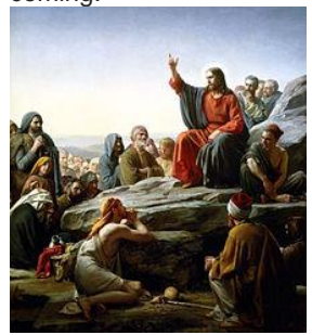
A 19th-century painting depicting the Sermon on the Mount, by Carl Bloch

Near the beginning of his ministry, Jesus <u>appoints twelve apostles</u>. In Matthew and Mark, despite Jesus only briefly requesting that they join him, Jesus' first four apostles, who were fishermen, are described as immediately consenting, and abandoning their nets and boats to do so (<u>Matthew 4:18–22</u>, <u>Mark 1:16–20</u>). In John, Jesus' first two apostles were disciples of John the Baptist. The Baptist sees Jesus and calls him the <u>Lamb of God</u>; the two hear this and follow Jesus. [135][136] In addition to the Twelve Apostles, the opening of the passage of the <u>Sermon on the Plain</u> identifies a much larger group of people as disciples (<u>Luke 6:17</u>). Also, in <u>Luke 10:1–16</u> Jesus sends <u>seventy or seventy-two of his followers</u> in pairs to prepare towns for his prospective visit. They are instructed to accept hospitality, heal the sick and spread the word that the Kingdom of God is coming. [137]