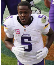
Bridgewater with the Vikings in 2015

https://www.youtube.com/watch?v=SP-oGaVC7Zo Teddy Bridgewater Uses Mom As Inspiration – YouTube