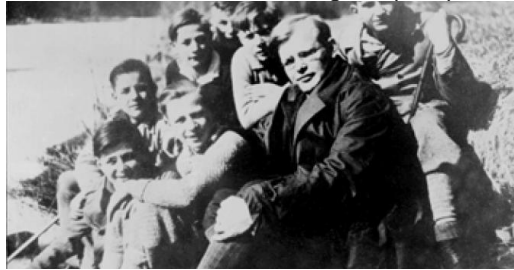
Dietrich Bonhoeffer on a weekend trip with confirmands in the spring of 1932.